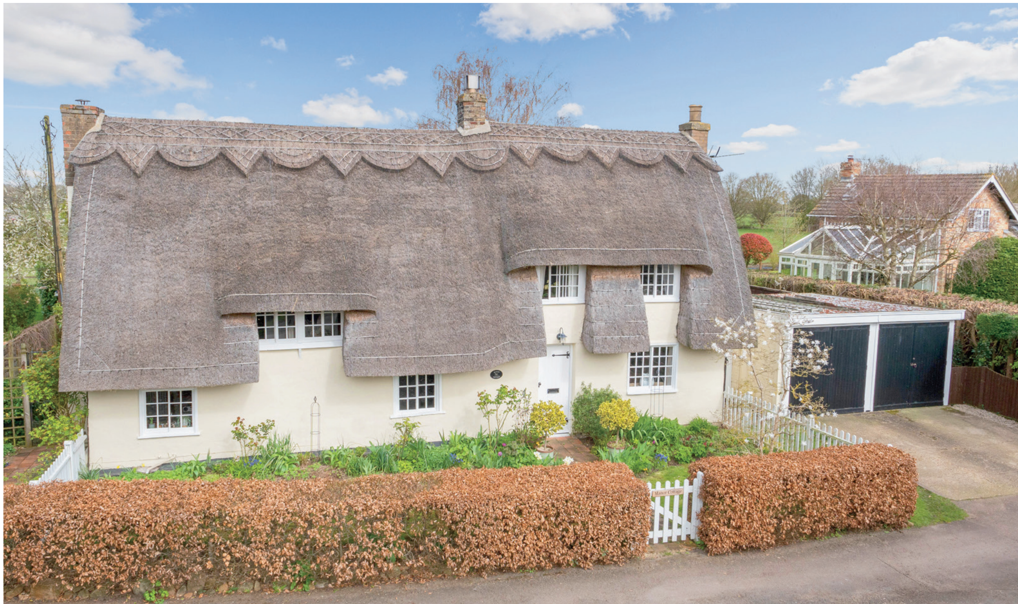
Manor Cottage Papworth Saint Agnes | Cambridge | Cambridgeshire | CB23 3QU